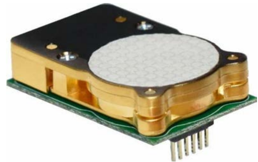
COZIR™ LP CO2 Sensor