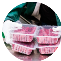
Modified Atmospheric Packaging